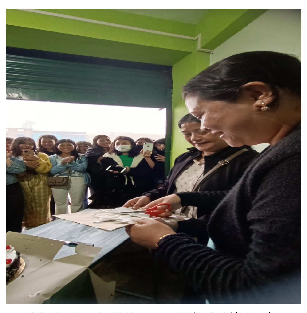
RELEASE OF THETHE DEPARTMNET MAGAZINE, 'ZEITGEIST' (9.6.2024)